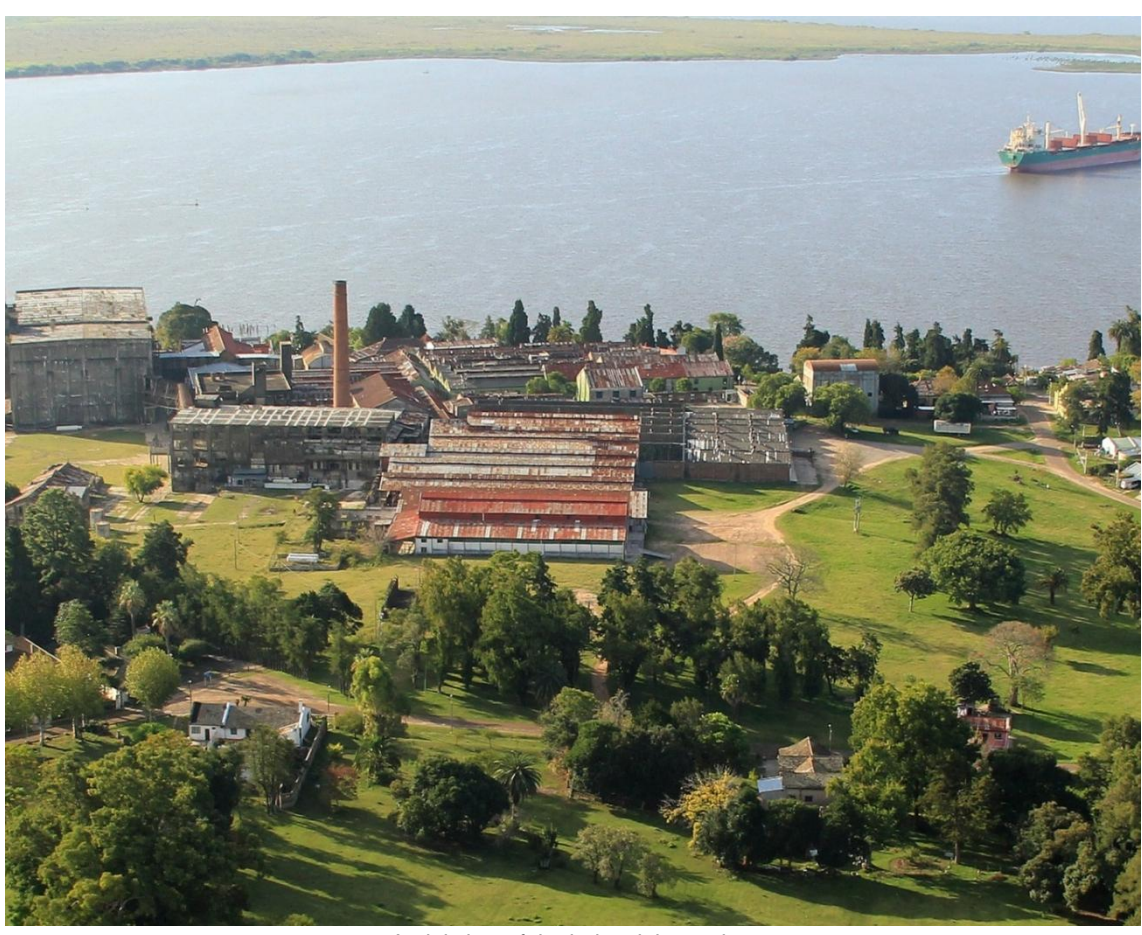
Aerial view of the industrial complex