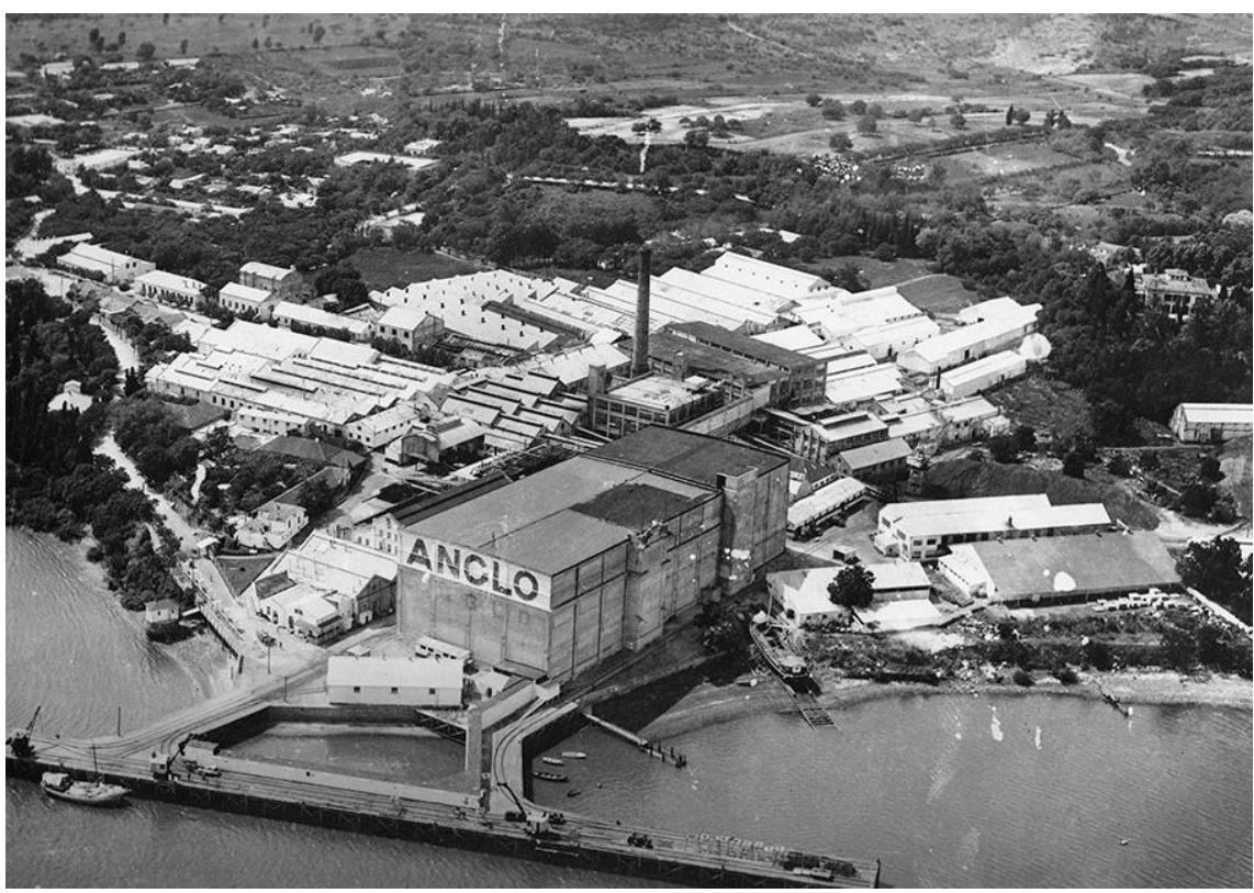
Liebig-Anglo industrial complex circa 1930