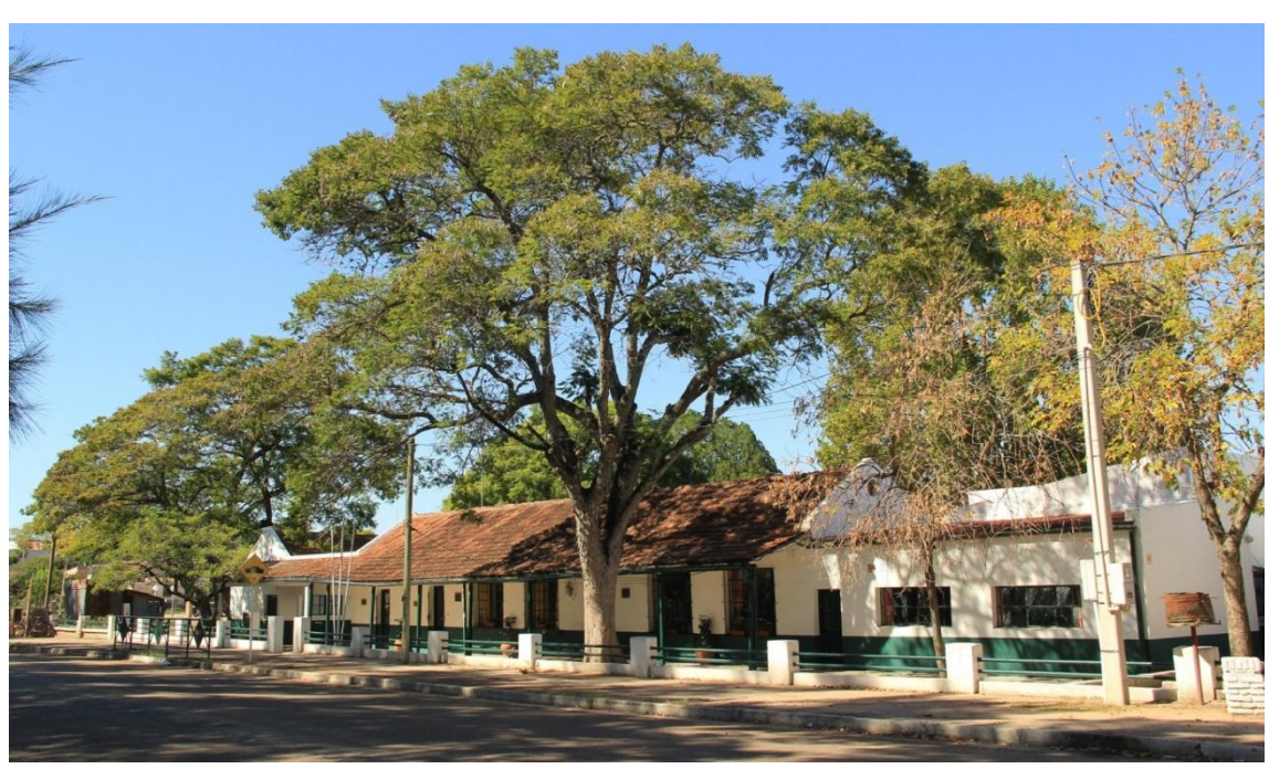
Anglo neighborhood – School