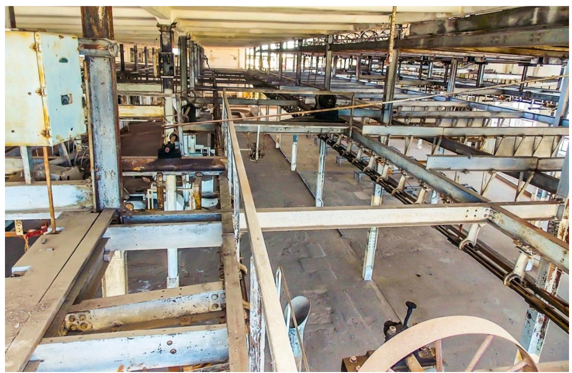
Internal view of the meat processing area